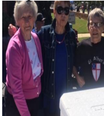
Hotdogs for all!