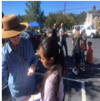
Waiting for the Hayride!